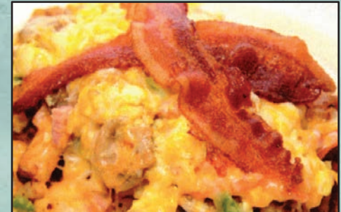
Sorry, can't Mess with the Mess... (no changes)

A plate of home fries, topped with scrambled eggs, ham, peppers, tomatoes, mushrooms, sausage & onions covered in Monterey Jack cheese & bacon. Served with our grilled corn bread. 11.49