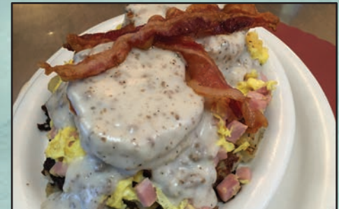
or the Kitchen Sink (no changes)

Medley of tomatoes, green peppers, mushrooms, onions & Swiss cheese. Served with home fries & whole wheat toast. 11.99