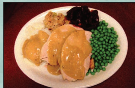
Thanksgiving Every Day

You love our breakfast, come join us for dinner too!