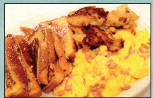
French Scramble The best of both worlds.

Eggs scrambled with Swiss cheese & diced ham, bacon or sausage. Served with French toast & home fries. 11.49