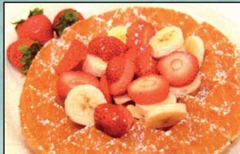
Fruity Favorite A sweet start to your day.