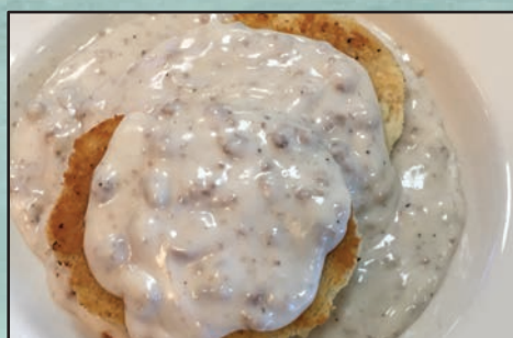
Biscuits & Gravy