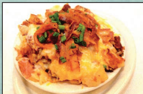
Honey Fries Get some to share.