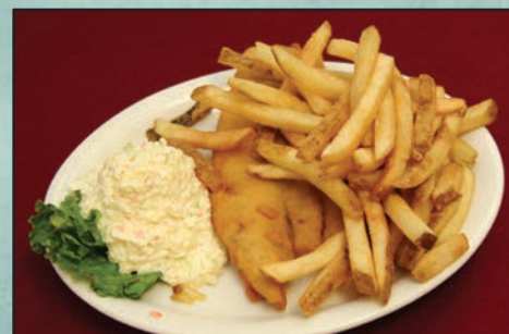
Have you had our popular Fish & Chips?