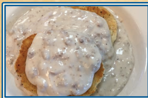
Biscuits & Gravy