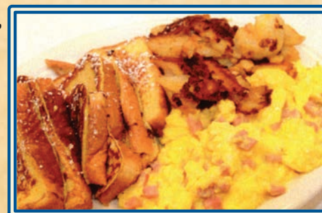
French Scramble The best of both worlds.

French toast topped with seasonal fruit & whipped cream. 8.99