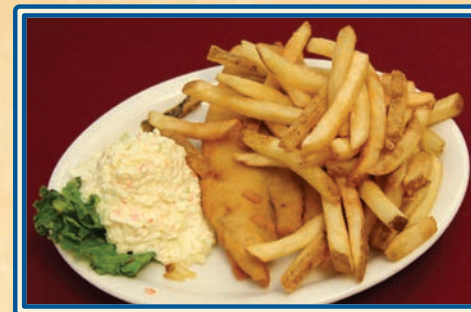
Have you had our popular Fish & Chips?

★ Alert! Many of our menu items contain nuts and/or are prepared on shared equipment.