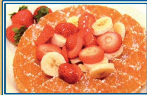
Fruity Favorite A sweet start to your day.