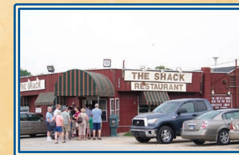
Where it all started.