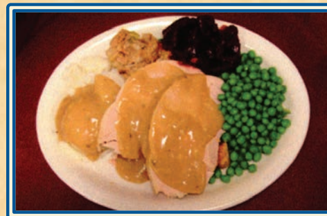
Thanksgiving Every Day

You love our breakfast, come join us for dinner too!