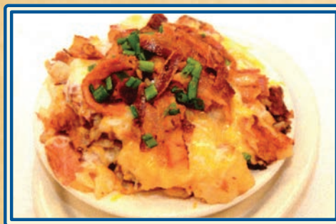
Homey Fries Get some to share.