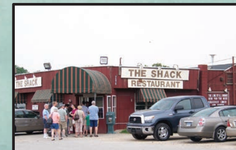
Where it all started.