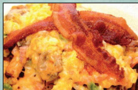
Sorry, can't Mess with the Mess (no changes)