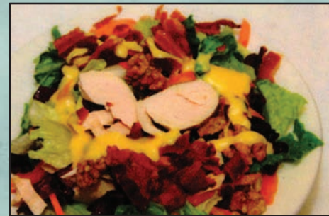
Cape Cod Salad